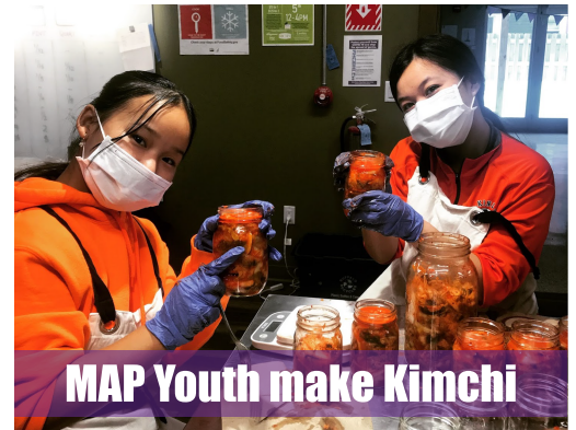
MAP Youth make Kimchi

All items were available for purchase at the farm!