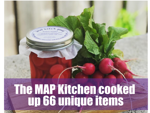
The MAP Kitchen cooked up 66 unique items