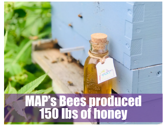
MAP's Bees produced 150 lbs of honey